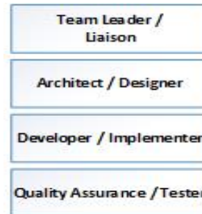
Figure 4. Team roles.

Most of the systems involve one or more of the following: programming, a database, a computer network, a Web interface. Java is the preferred language for projects that require programming. Non-programmers or weak programmers can contribute in many ways other than programming. A team usually consists of 3-5 students – an Architect-Designer, one or two Developers-Implementers, a Quality Assurance-Tester, and a team Leader-Liaison (Figure 4). For small teams several team member functions can be combined.